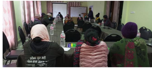
FIGURE 2: PARTICIPANTS OF PRE-CONSULTATION MEETING AT PROVINCE-5 (BUTWAL) ON EX-KAMAIYA ISSUE

With an aim to identify the advocacy priorities and analysis, key issues systematically documented and prepared as report to be presented in the FF's workshop, RDN facilitated to organize 3 events of pre-consultation workshops at province-2, province-5 and province-7 separately. The program was organized in Dahangadhi (province-7) on 14 th January, 2022 targeting freed Haliya issue. The consultation meeting was organized in Butwal (province-5) on 18 th January, 2022 focusing ex-Kamaiya issue. Similarly, the meeting was organized at Janakpur (province-2) on 17 th February, 2022 at Janakpur targeting Harawa-Charawa. A total of 64 participants in which 52 ex-bonded labours (Freed Haliyas-16, Ex-Kamaiya -14 and Harawa-Charawa-15) actively participated in these consultation meeting. The disaggregated data of the participants is presented as below;