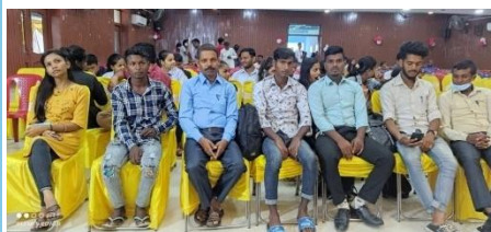
FIGURE 1: HC YOUTHS PARTICIPATING IN YOUTH FESTIVAL