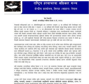
FIGURE 3: PRESS RELEASE BY NATIONAL HC NETWORK ON THE OCCASION OF INT. LABOUR DAY-MAY-1 ST

The International Labours Day (May-1 st ) was celebrated in close coordination at federal and provincial level. The Agriculture bonded labours; Harawa-Charawa, Haliya and Kamaiyas were encouraged to participate in the various programs organized on the occasion of international labours. The right-holders organizations raised their voice and concern. Similarly, the TV talk program was broadcasted from Nepal Television on international labour day. RDN also facilitated to national Harawa-charawa rights forum to release the press statement on the occasion of International Labour Day-May 1 st , 2022. Mr. Shayam Sundar Sada-chairperson of district Harawa-Charawa rights forum of Siraha was invited by NTV to capture his interview before the international Labour Day-May 1 st , 2022. RDN provided its technical and financial support to facilitate the process accordingly.